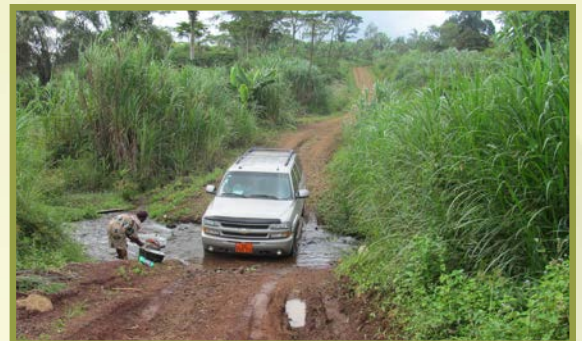
On the road again! Arriving Muambong