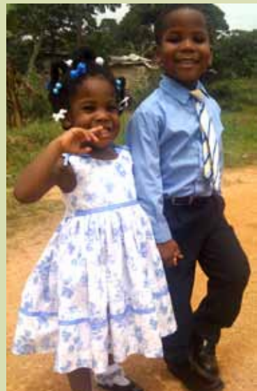
Sunday in the Village. We have taken the children to meet relatives in both of our villages