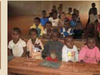
First granders at the Baka Pygmy school in Mbang enjoying their new class and chairs