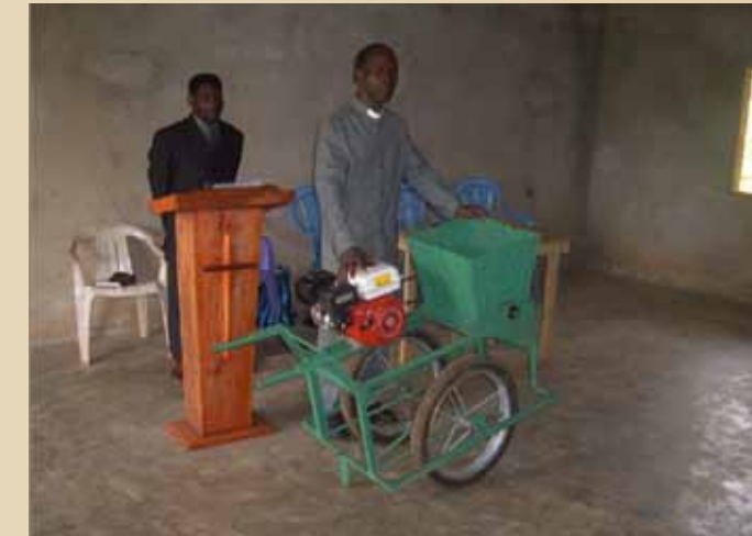
Pastor Pray over newly donated grinding machine