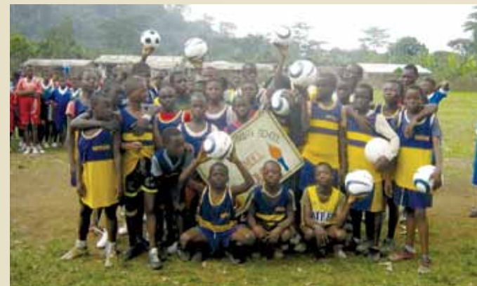
Sports Evangelism: School kids wear Jerseys donated by a school in Baggs, WY and display soccer balls donated by children Sunday school class in Florida! A total of 200 footballs (soccer) were given to BFL. We are using them for sport evangelism

BREAD FOR LIFE International Changing hearts. Changing lives. Partnering with Commission TO EVERY NATION PO Box 291307 Kerrville, TX 78029 Phone: 830-896-8326