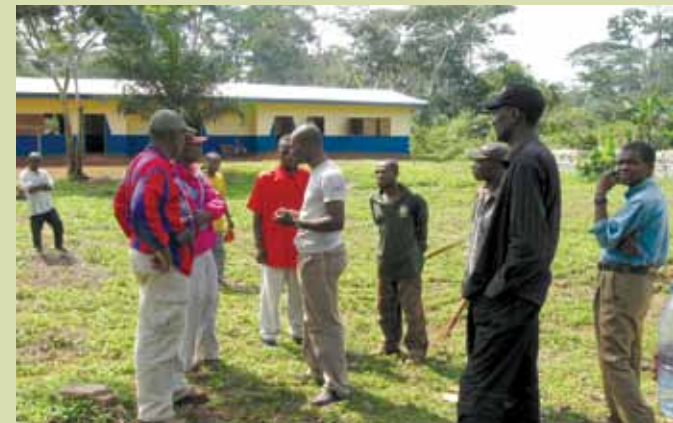
Newly completed school: Our team visits and talk with teachers and parents in front of our newly completed school classrooms for Baka Pygmies. Thanks for making this possible!

We have been invited to plant a community based church in the city of Bamenda in the NW Region of Cameroon. The church is slated to start in October this year. One of the main goal of the church would be a concerted effort to reach out to government officials and decision makers in that region. Many who are in the occult. Be praying for us to find a strategic place for meetings; for provision to renovate, for one years rents and for funds to provide for the pastor and his family.