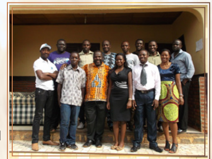
BFL 101: God is blessing BFL with new staff and interns who are taking over some of my roles. I hold Team Building meetings every so often to acquaint them with BFL and also vision cast.

Commission to Every Nation PO Box 291307 Kerrville, TX 78029