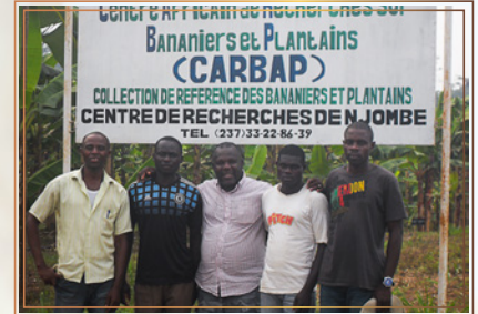
Learning trip with some of our newly employed Dimako farm workers to the largest plantain research center in the world at Njombe near Douala. Many of this guys are in their late 20s or early 30s. This is the first time they are gainfully employed and they are so happy.

The first of such bases is in Dimako, among the marginalized Baka Pygmy community. We have acquired over 250 acres of land and are embarking on a "demonstration" or "experimental farm" dubbed "Beulahland" Farms. Among the many items on our 'wish' list this year is our hopes to acquire a water drilling machine. A typical bore hole here costs between $10,000 and $16,000. We recently found out that we can buy a portable water drilling machine for around $15,000. I will ask my board for permission to use all funds raised at our upcoming banquet to buy a water drilling machine or tool. This will be an immense help in our new base in Dimako. It will also be used to provide water to others in communities around Cameroon at an affordable price. Kindly join us in making a one-time gift towards this. Please send all support to: