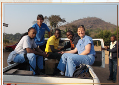
"To the uttermost part..": short term missionaries and our staff enter our newly donated truck enroute to their next medical outreach in Bossa.