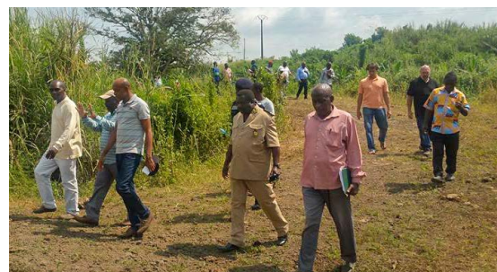
Exploring 50 hectares (125 acres) of land granted BFL with government and CDC officials