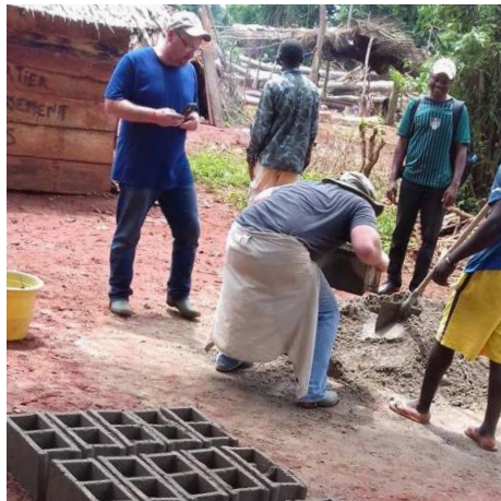
Molding blocks for Loussou church plant

WATER: Three water wells were dug and water supplied to two villages through our village and agricultural outreaches. What a blessing it was to see folks rejoice as they receive clean water and the water of life for the first time!