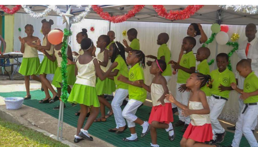
ROHA children performing for Christmas