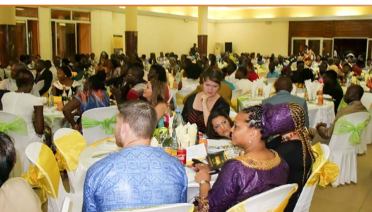
22nd and 12th Anniversary Celebration banquet

"We must quickly carry out the tasks assigned us"