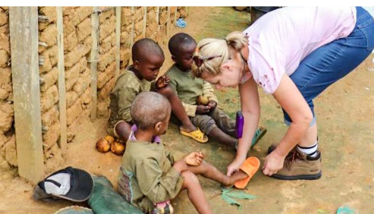
Short-Term Missionary working with children in Loussou village