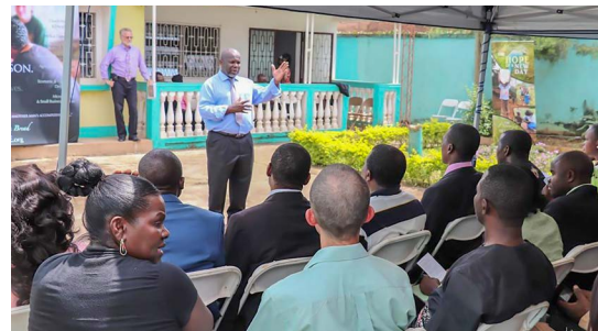
over 70 pastors gathered at our ministry office in Yaoundé for our first “Leading with Intentionality” Conference.

The single greatest obstacle to the impact of the gospel has not been its inability to provide answers, but the failure on our part to live it out.