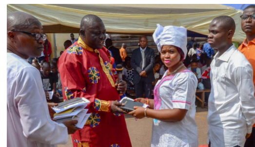
Giving out bibles and literature in the prisons