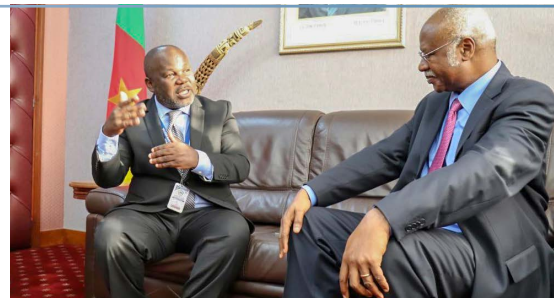
Sharing about our work and vision with the Prime Minister of Cameroon

We were privileged to meet several top government officials in Cameroon in 2018. The highlight of these meetings was with the Prime Minister of Cameroon, along with his Director of Cabinet to discuss the incredible work that Bread For Life is doing. In a far reaching discussion lasting more than 90 minutes, we talked about the work of BFL in Cameroon and about the most under-developed resource in Cameroon – its people and how leadership training could positively impact the nation. Through the push of the Prime Minister, over 120 acres of land has been ceded to BFL by the Cameroon Development Corporation to develop a multi-purpose training campus. We also met with officials at the U.S. Embassy to discuss the sustainable agricultural and husbandry projects BFL is doing, and identified resources that may help facilitate an expansion of these training programs.