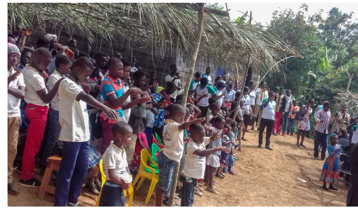
Celebrating 5 years of Antioch Baptist Church plant with the village of Bambili

Please do not reduce your level of giving to your local church in order to support this ministry