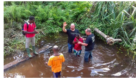
Seven Baka Pygmies of Loussou identified with Christ in water baptism