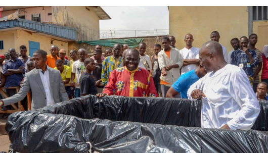
Makeshift baptism at the major prison in Yaoundé. 1500 decisions for Christ and more than 80 baptisms

You made it all possible through your prayers and generous giving. Thank you! We saw God work in incredible ways in and through us in 2017. Thankful for the way He continues to open doors. So much happened, so much that it will take more ink and paper. We will try to summarize and highlight just a few areas.