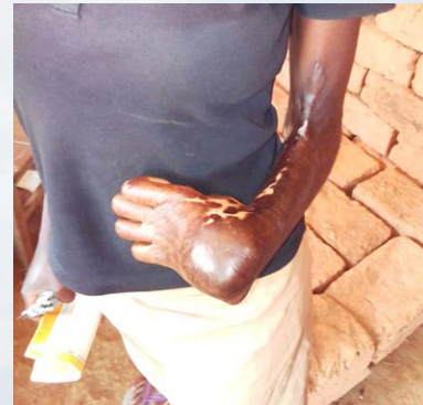
Many have injuries from fire because nobody helps them during seizures.