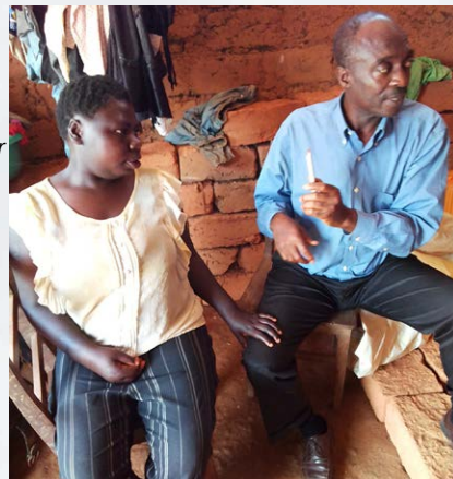
The temporary meeting place has brought the village together for worship and community work

The villagers look with suspicion anyone affected by this ailment. Many believe the sickness is contagious. Whenever a person has an epileptic fit everybody takes off in full speed instead of helping the person. That is why many of the sufferers have injuries from fires because of lack of care. So education is going to be a very important part of this endeavor. The patients are so poor that they can't afford drugs that would curb the number of seizures and consequently reduce brain damage.