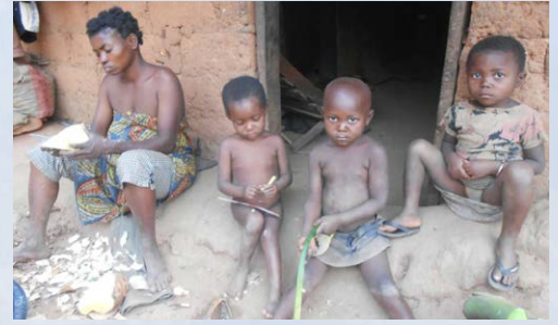
Two out of three children under 5 years suffer from anemia and other micronutrient deficiencies. Up to 45% of children's deaths are linked to under-nutrition