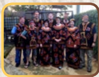
↑Short Term Team, from west Conroe Baptist Church, dressed in native NW Region Clothes.