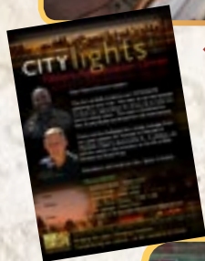
→ CITYLIGHT appreciation Banquet in Buea