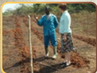
↑Godlove Nsuli, Beulahland farms worker, shows off a patch of developed forest land.

If you want to make an investment that will have multiplying effect, this may be it. It cost about $200 to develop each acre of our forest farmland. $200 will cover land