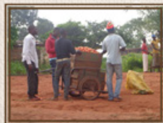
Marketing: Trucking tomatoes to the Market.

Bridging the gaps. Changing mindsets. Transforming our culture... to the standard of Christ!