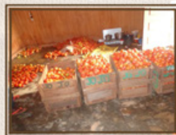
Despite the initial challenges of cultivating our first two and a half acres of land, we have started harvesting tomatoes from the Dimako farm.