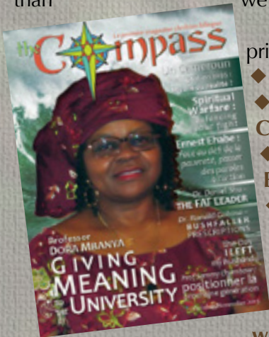
Cover of our soon to be published tri-annual bilingual Magazine

You've all been a vital part of the ministries of Bread for Life. That is why I have taken this time to share the vision and needs of BFL with you. My prayer in sharing this is that God will move in your heart as He has in ours and that together we'll be used by Him to accomplish more than we can imagine.