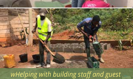
housing at Beulahland Farms

Tax deductible gifts to Bread For Life may be sent to: Commission To Every Nation: PO Box 291307, Kerrville, TX 78029 • (830) 896-8326