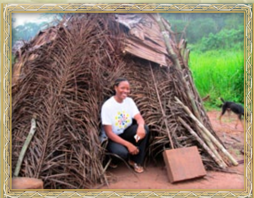
In front of Baka Pygmy hut, during field trip to the Eastern part of Cameroon.

Jochebed grew up in a religious environment where she was exposed to God's word and participated in church activities. As one of 9 children of a Presbyterian