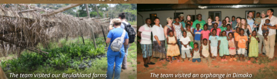
The team visited our Beulahland farms