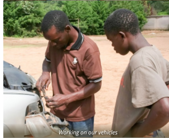
Working on our vehicles