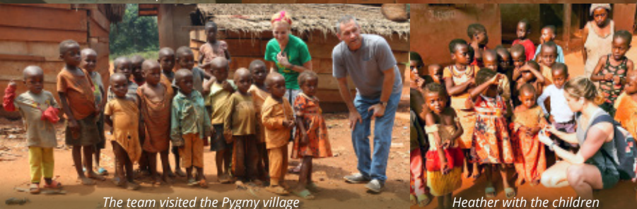
The team visited the Pygmy village