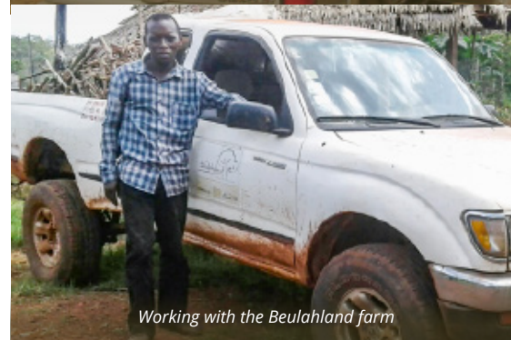
Working with the Beulahland farm