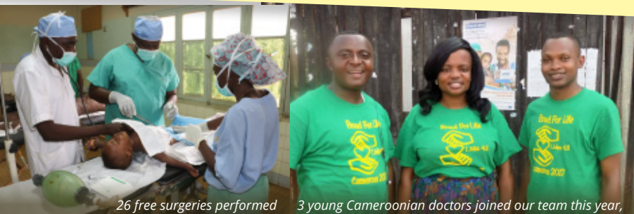
26 free surgeries performed

Many thanks to the awesome BFL staff for their hard work and dedication! Without them, it would not have been possible. We enjoy tremendously our time with them serving our great God together. May He be always glorified by our efforts."