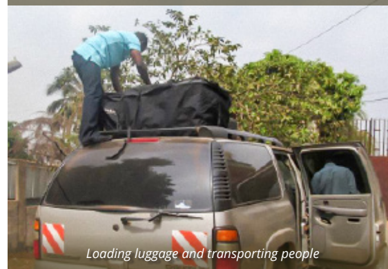
Loading luggage and transporting people