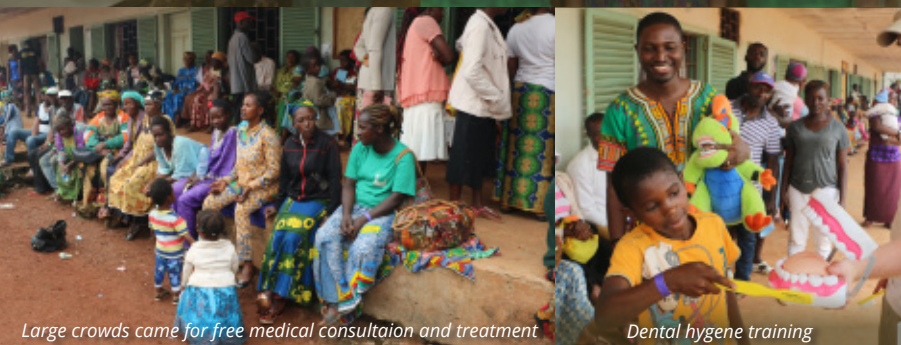
Large crowds came for free medical consultation and treatment